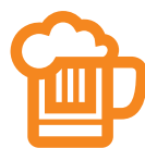
brewery and malt products